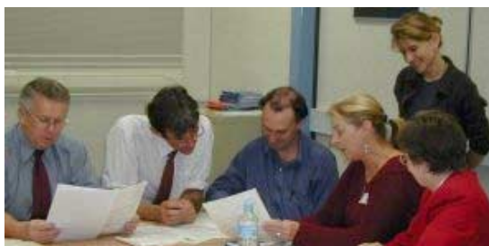
Above: Knox staff debating the pros & cons of buying recycled content toilet paper at their ECO-Train session.

Feedback from the training has been overwhelming positive with all participants saying the sessions increased their knowledge of environmental products.