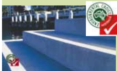
Left: Ecoblend cement (containing 65% reclaimed steel slag) steps at Beacon Cove.

Using these waste products, in place of virgin materials, means the concrete has significantly less energy input and emission output making it a product with a very low embodied energy. Surprisingly Ecoblend cements are 10 -20% stronger than the non-blended product. Ecoblend can be purchased as a bagged product or made to order containing 30 -90% reclaimed steel slag. All ICL products are compatible with Vic Road specifications.